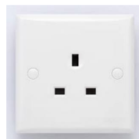
接線裝置 WIRING DEVICES