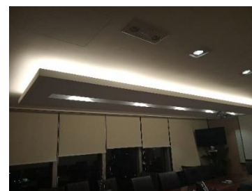
燈槽 Light Trough