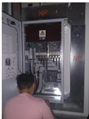
配電箱 DISTRIBUTION BOARDS